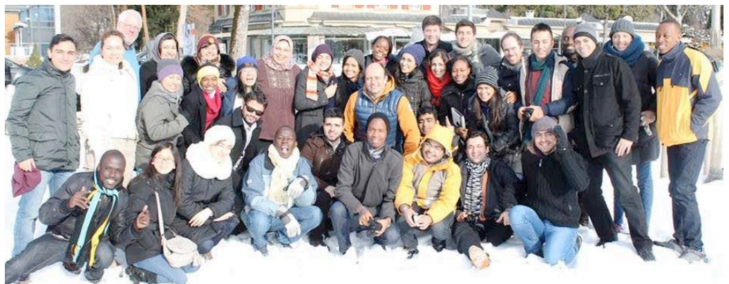
The IC at a sustainability course initiated by YES.

Four of WSEN IC members attended a two-week course program by Youth Encounter on Sustainability