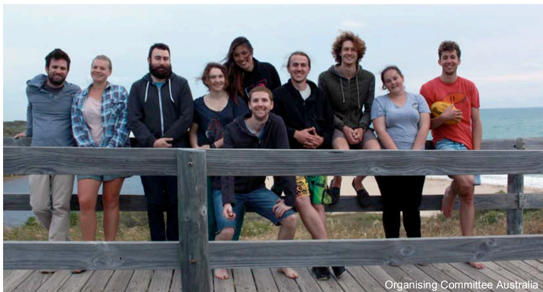
Organising Committee Australia

We are now in the process of outlining the logistical arrangements for the event, and getting our team of volunteers together to help make this event a success. Our community event the Forgotten Earth: Reconnecting with Nature Fair is also shaping up to be a really integral component of the Summit and we are looking forward to opening the ideas of WSEN to the wider community. If you are interested in finding out more about this event, please check out this link: https://www.facebook.com/events/978485972185569/